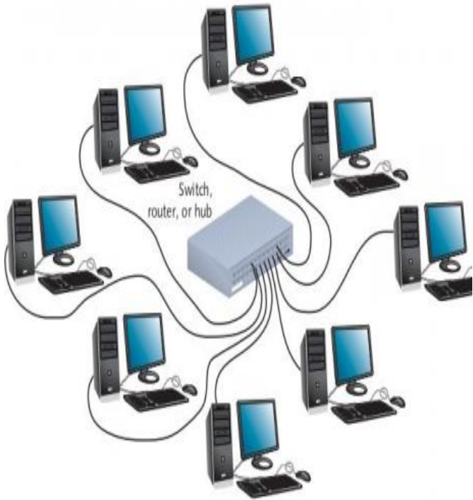
Figure 1: Star Network

that the base station must be within radio transmission range of all the respective nodes and is not as fit as other networks in view of its need on a single node to create the network. The star network topology, usually used in Body Area Networks (BAN) also called Body Sensor Network (BSN), where sensors are allotted on the body of a unit.